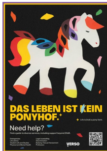
ZHdK; Mental Health Awareness Poster Campaign 2024

Images below are linked – click to view more.