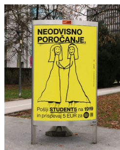
Radio Študent; Donation Campaign 2022