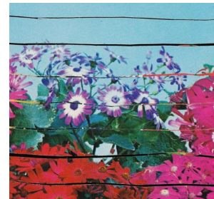
MRFY – Najlepše bitje; Animation 2023