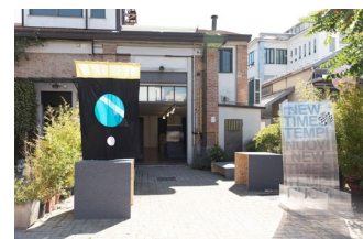
Milano Design Week – NEW TIMES; Exhibition Identity 2022