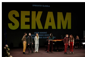
National celebration for Reformation Day 2022; Typographic Visuals; 2022